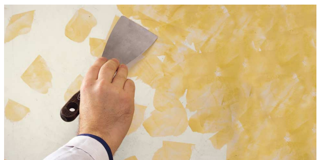
AGLAIA PIGMENTED MARVELIZER