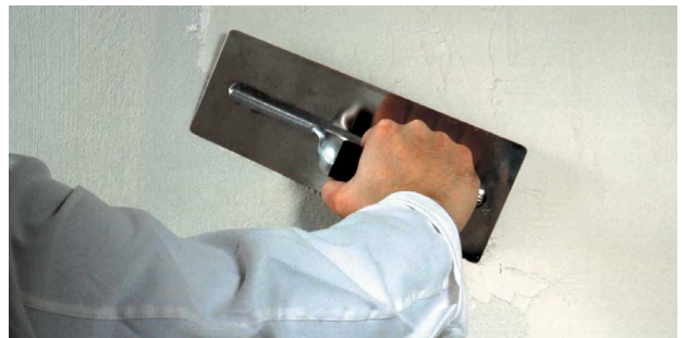
AGLAIA MARVELIZING SURFACER