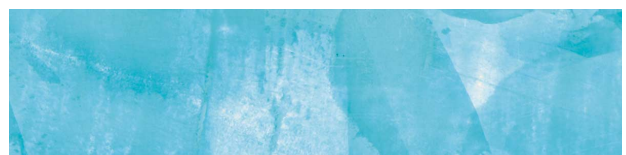
Sky blue (14)

For typographical reasons, there may be possible color deviations compared to the original color sample. For further information on our products and on processing, please refer to our actual Technical Information Sheets.