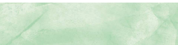
Mint green (05)