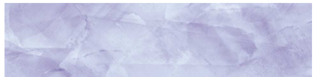
Pastel blue (12)