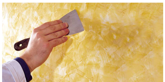
Polish to obtain a marble shine