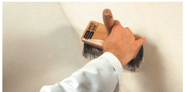
AGLAIA RESIN BONDING COAT

The plant based AGLAIA PIGMENTED MARVELIZER should be processed and polished at a brisk pace within one day. Application is particularly easy using the special AGLAIA SPATULA. Apply cross-wise in very thin layers using spot application technique and a certain pressure to minimize burrs. Repeat applications after 1 to 2 hours until complete coverage is achieved. A total of 3 to 5 coats will be required. The spots may be positioned isolated or close to one another. The only thing that matters is that the spatula strokes that will become visible again after polishing, look unidirectional and „accidental“. Remove protruding edges before each application.